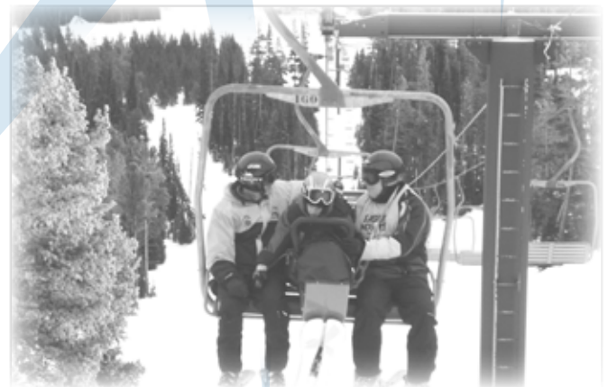
Eagle Mount volunteers cruising up the chairlift with a student from Montana School for the Deaf & Blind.